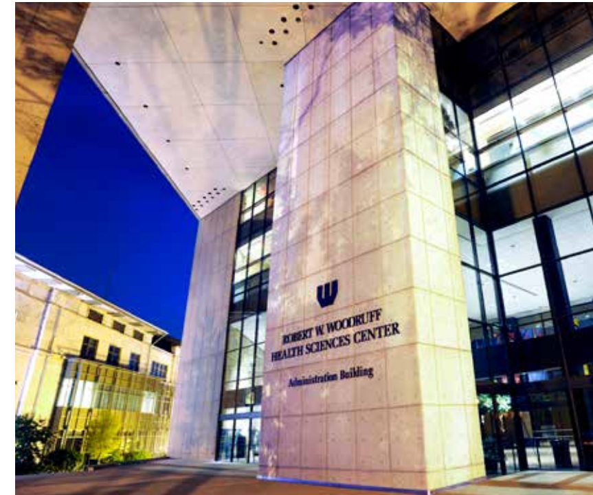
The WHSC is a major contributor to the Atlanta economy.

offered major health and societal benefit. Since FY 2000, the university has filed more than 3,400 US patent applications and been issued more than 800 US patents. In that time, Emory has executed more than 850 license agreements, resulting in more than $1.3 billion in licensing revenue, thereby creating additional funding for new and ongoing research.